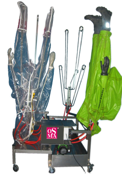
sample picture: HT 304-A