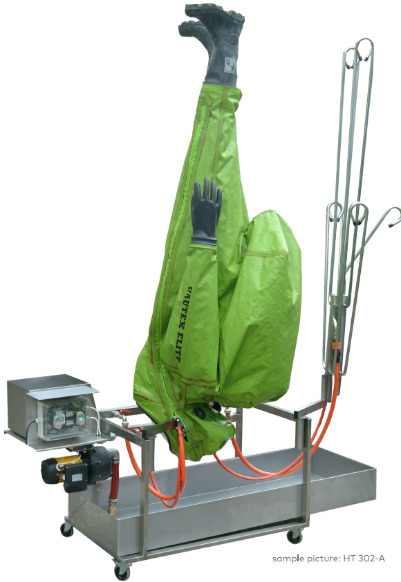
sample picture: HT 302-A

Modular and mobile washing, disinfecting and drying station