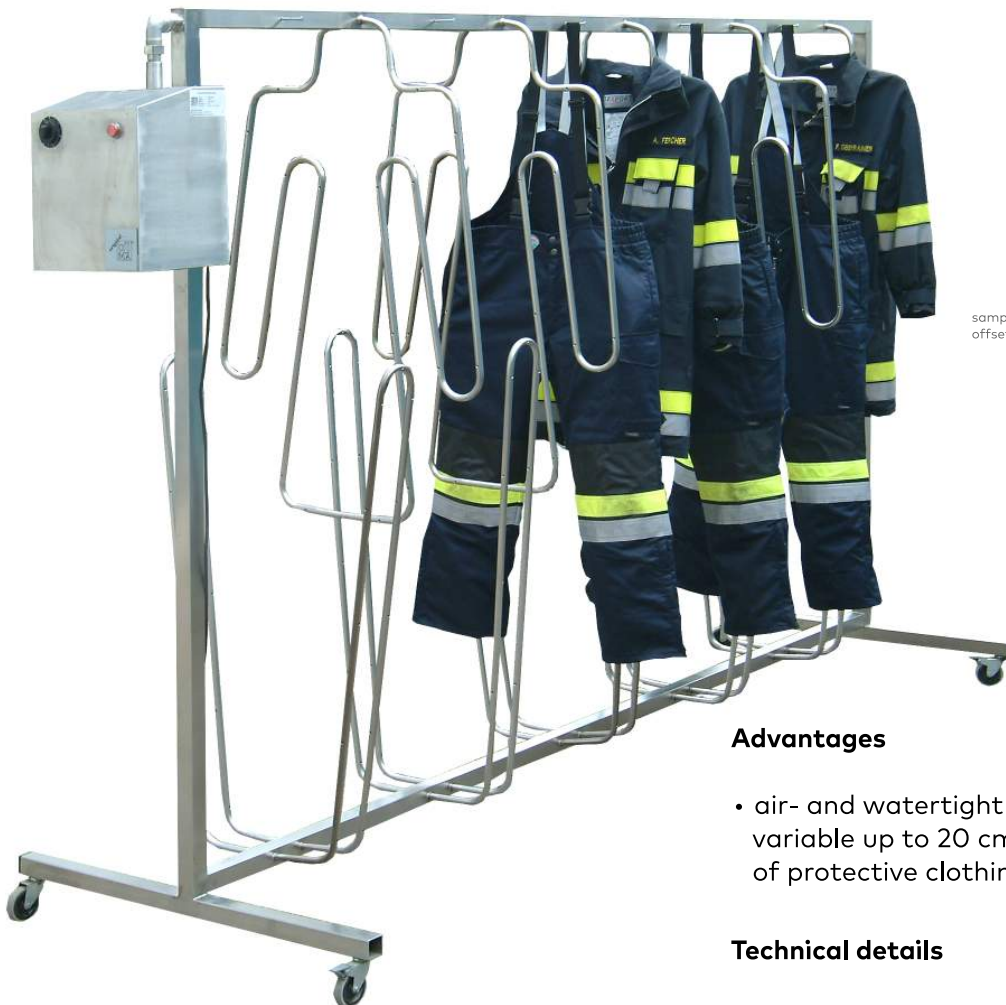
sample picture: OSMA Fireman for 5 jackets and trousers offset arrangement for jackets and trousers